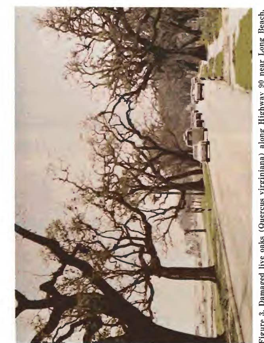
Figure 3. Damaged live oaks (Quercus virginiana) along Highway 90 near Long Beach, Mississippi.